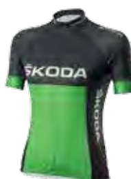
Women's Jersey €35