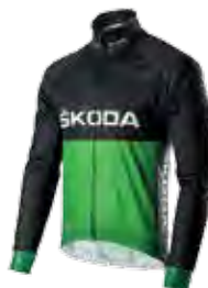
Men's Jacket €65