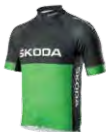
Men's Jersey €35