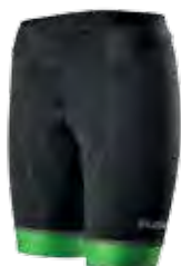
Women's Shorts €40