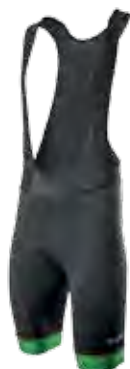
Men's Bibshorts €45