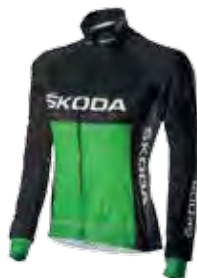
Women's Jacket €65